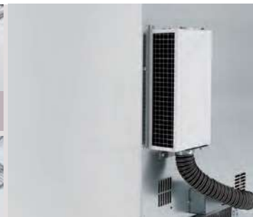
Fresh air particle filter