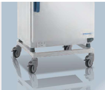
Support stand with casters